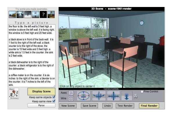
Figure 3: Kitchen location vignette defined with WordsEye