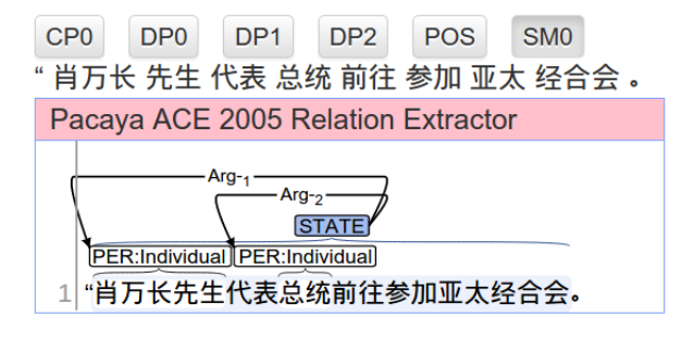
Figure 2: ACE entity relations viewed through Quicklime (Section 3.7).

Relations are extracted for every pair of entity mentions. We use a log-linear model with both traditional hand-crafted features and word embedding features. The hand-crafted features include all the baseline features of Zhou et al. (2005) (excluding the Country gazeteer and WordNet features), plus several additional carefully-chosen features that have been highly tuned for ACE-style relation extraction over years of research (Sun et al., 2011). The embedding-based features are from Yu et al. (2014), which represent each word as the outer product between its word embedding and a list of its associated non-lexical features. The non-lexical features indicate the word's relative positions comparing to the target entities (whether the word is the head of any target entity, in-between the two entities, or on the dependency path between entities), which improve the expressive strength of word embeddings. We store the extracted relations in CON-CRETE SituationMentions. See Figure 2 for