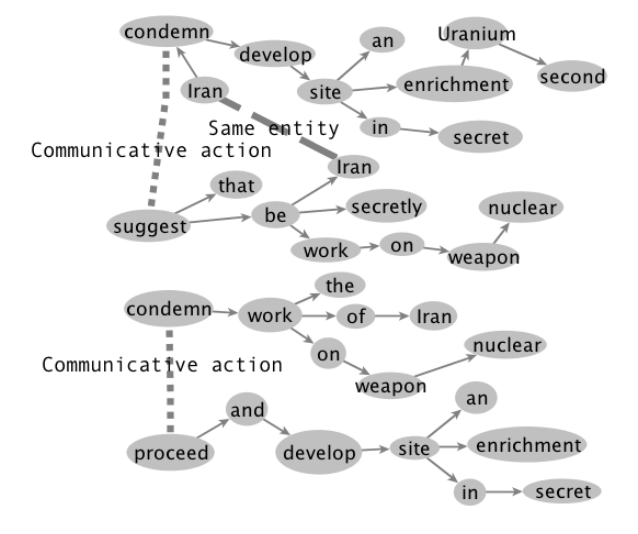
Fig. 2: A fragment of PT showing the mapping for the pairs of communicative actions.

gives zero result because the arguments of condemn from T_1 and T_2 are not very similar. Hence we generalize the subjects of communicative actions first before we generalize communicative actions themselves.