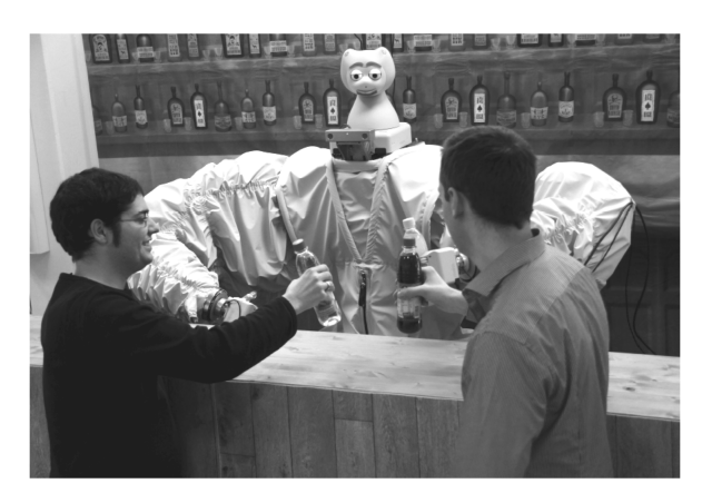
Figure 1: The robot bartender with two customers

put. The SSE is modelled as a hierarchy of two connected Markov Decision Processes (MDPs) with action selection policies that are jointly optimised in interaction with a Multi-User Simulation Environment (MUSE).