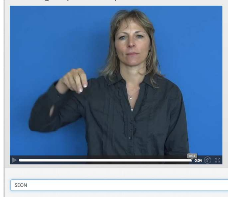
Figure 3: Study interface: screenshots

In the resulting set of items, each letter of the DSGS finger alphabet occurred at least once (with the exception of -X-, which did not occur in any of the town names that met all of the above criteria).