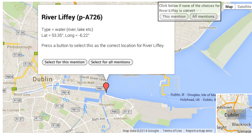
Figure 2: Example candidate for the location mention River Liffey and its gazetteer entry information shown in a popup.