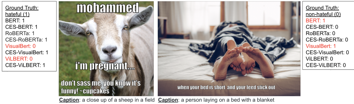
Figure 2: Two representative samples of unimodal and multimodal predictions, with and without the CES approach.