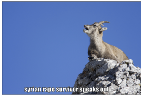
Caption: a goat standing on a rock in the snow

Example of better classification: BERT: not hateful (incorrect) CES-BERT: hateful (correct)