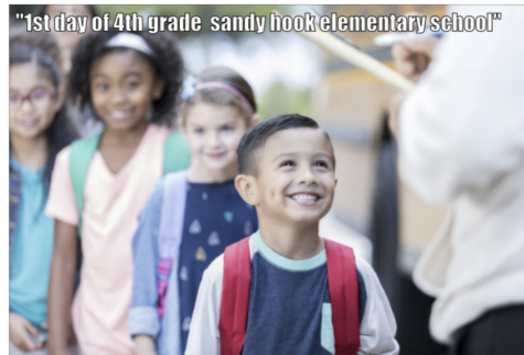
Caption: a group of young children standing next to each other

Example of better classification: ViLBERT: not hateful (incorrect) CES-ViLBERT: hateful (correct)