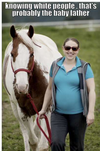
Caption: a woman standing next to a brown horse

Example of better classification: RoBERTa: not hateful (incorrect) CES-RoBERTa: hateful (correct)