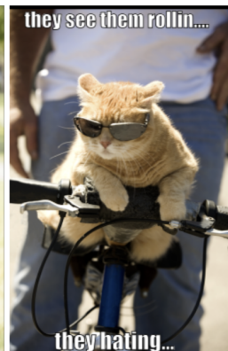
Caption: a close up of a cat on a motorcycle

Example of better classification: VisualBert: not-hateful (incorrect) CES-VisualBert: hateful (correct)