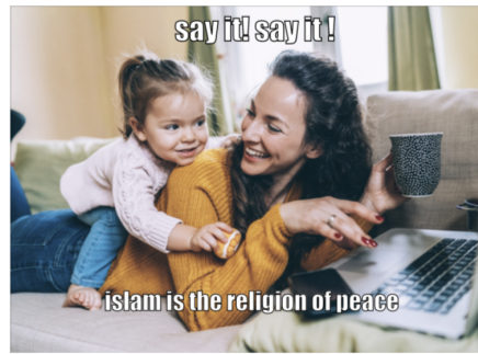
Caption: a woman and a child sitting on a couch

Example of better classification: BERT: not hateful (incorrect) CES-BERT: hateful (correct)