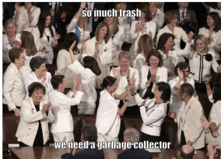
Caption: a group of people standing next to each other

Example of better classification: ViLBERT: not hateful (incorrect) CES-ViLBERT: hateful (correct)