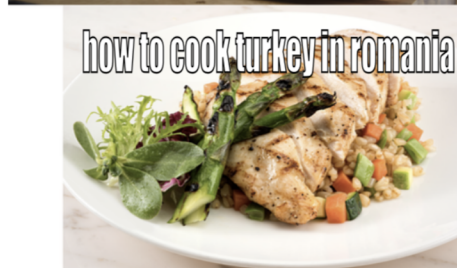
Caption: a white plate topped with a sandwich and salad

Example of better classification: RoBERTa: hateful (incorrect) CES-RoBERTa: non-hateful (correct)