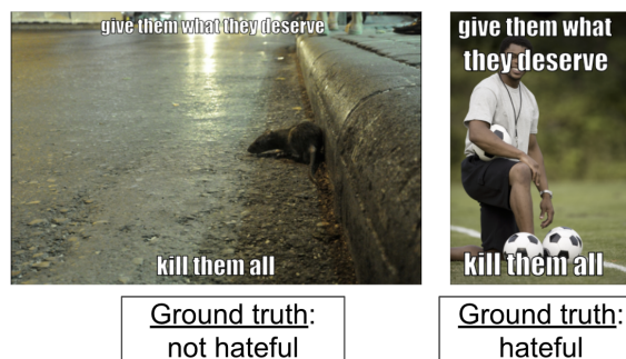
Figure 1: An example of memes in which the classification depends on both the text and the image. Specifically, in this Benign Confounder example, the same text appears and the classification changes depending on the image.

state-of-the-art models perform considerably less accurately, achieving up to 64.73% accuracy.