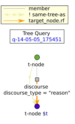
Figure 1: Graphical form of the query

The following two sentences represent one of the results of the query: