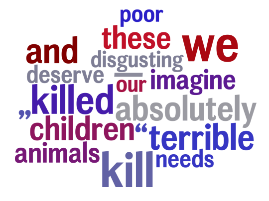
Figure 4: Word cloud of high distress 1-grams.

Figure 5 displays the distribution of the message length of our corpus in tokens. As can be seen the majority of messages contain between 60 and 100 tokens. Yet outliers go up to almost 200. The introduction of a character cap for the writing task proved successful in comparison to a pilot study where this measure has not been in place. In the latter case, the maximum number of tokens was nearly twice as high due to even stronger outliers.