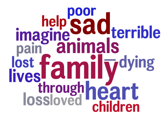
Figure 3: Word cloud of high empathy 1-grams.