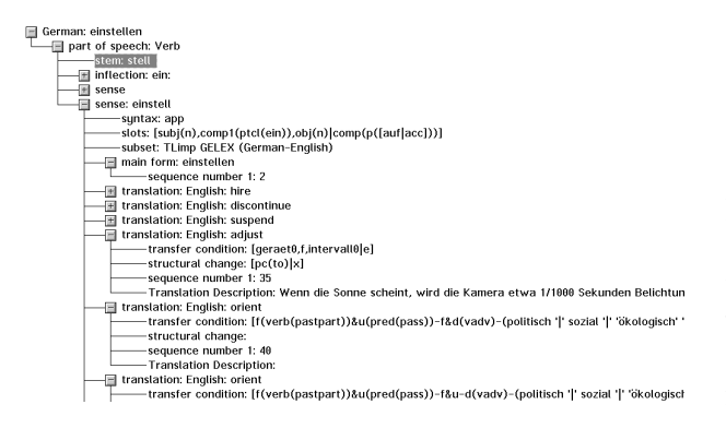
Fig 1 a) data base entry einstellen ('translation' represents links between SL and T entries)