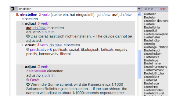
Fig 1 b) product entry einstellen

The obvious disadvantages of RBMT are high cost, weaknesses in dealing with incorrect input and in making correct choices with respect to ambiguous words, structures, and transfer equivalents.