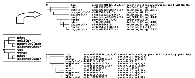
Fig.3 Selection of analyses via correspondences (prefer first Spanish analysis because of subj-congruity)

For a subset of the Spanish corpus (reference sentences of the grammar, parts of the open source Leeds corpus (Sharoff, 2006), and Europarl), syntactic analyses have been computed and stored in the database. As the number of analyses grows extremely with the length of sentences, only relatively short sentences (up to 15 words) have been considered. These analyses are currently compared to the analyses of the German translations of the corresponding sentences (one translation per sentence), which are taken as a kind of 'gold' standard as the German analysis component (as part of the translation products) has proven to be sufficiently reliable. On the basis of the comparison a preference on the competitive analyses of the Spanish sentence is entailed and used for defining a statistical evaluation component for the Spanish grammar. Fig.3 shows the corresponding representations in the database for the sentence Aumenta la demana de energía eléctrica por la ola de calor <sup>3</sup> and its translation die Nachfrage nach Strom steigt wegen der Hitzewelle/the demand for electricity increases because of the heat-wave.